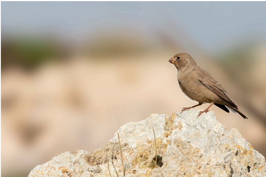
Bucanetes githagineus, Campobello di Mazara 25.X.2019